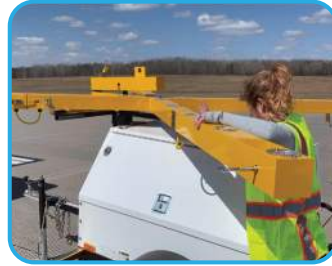
2. Extend the 4 light assembly arms