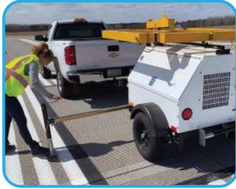
1. Level as necessary using 3 leveling jacks