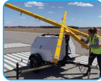
3. Tilt the light to the upright position