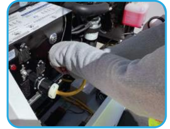
4. Start the generator and activate the lights