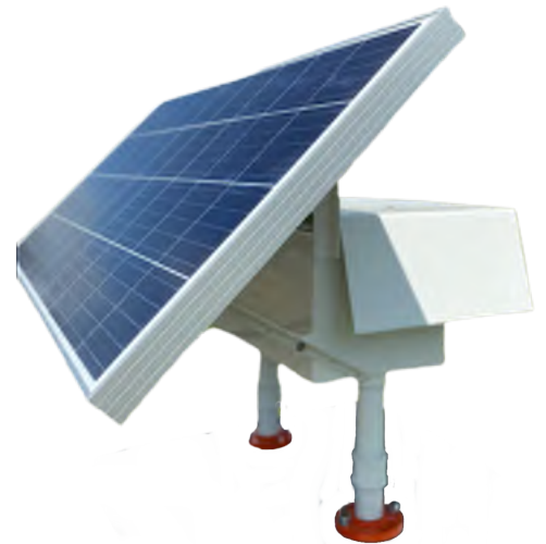
Optional Solar Power Supply SPS-100

Sales and Technical Support: 1.800.553.6269 Sales@halibrite.com