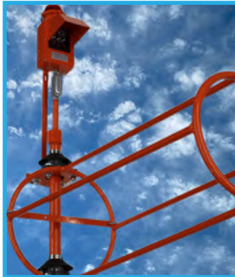
External Light Kit