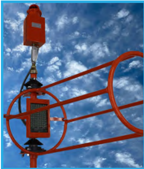
Internal Light Kit

Provides visual indication of wind direction and velocity for pilots at Vertiports, Heliports, smaller airfields, and as supplemental wind indicators near runway touchdown areas on large airfields.