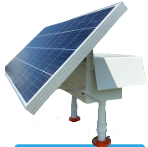
Optional Solar Power Supply

*One windsock included in every L807 order