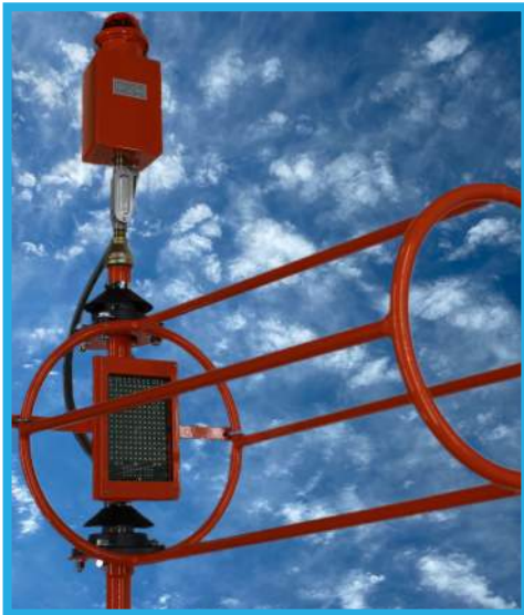
Internal Light Kit

Applications: Provides visual indication of wind direction and velocity for pilots at Vertiports, Heliports, smaller airfields, and as supplemental wind indicators near runway touchdown areas on large airfields.