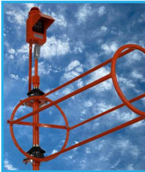
External Light Kit