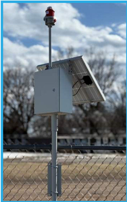
Fully Installed Example