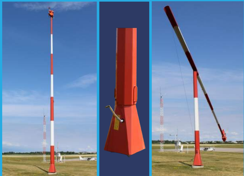
Optional Beacon Tipdown Pole